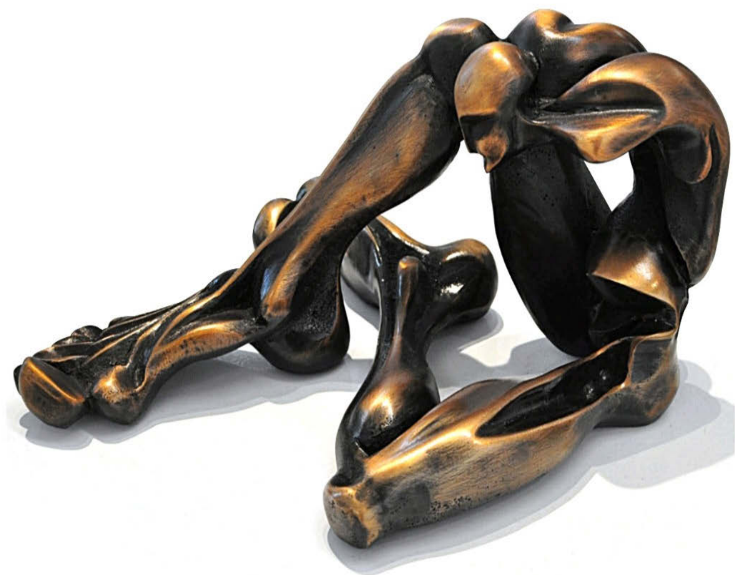
Immortality 41x33x18 cm Bronze casting 2018