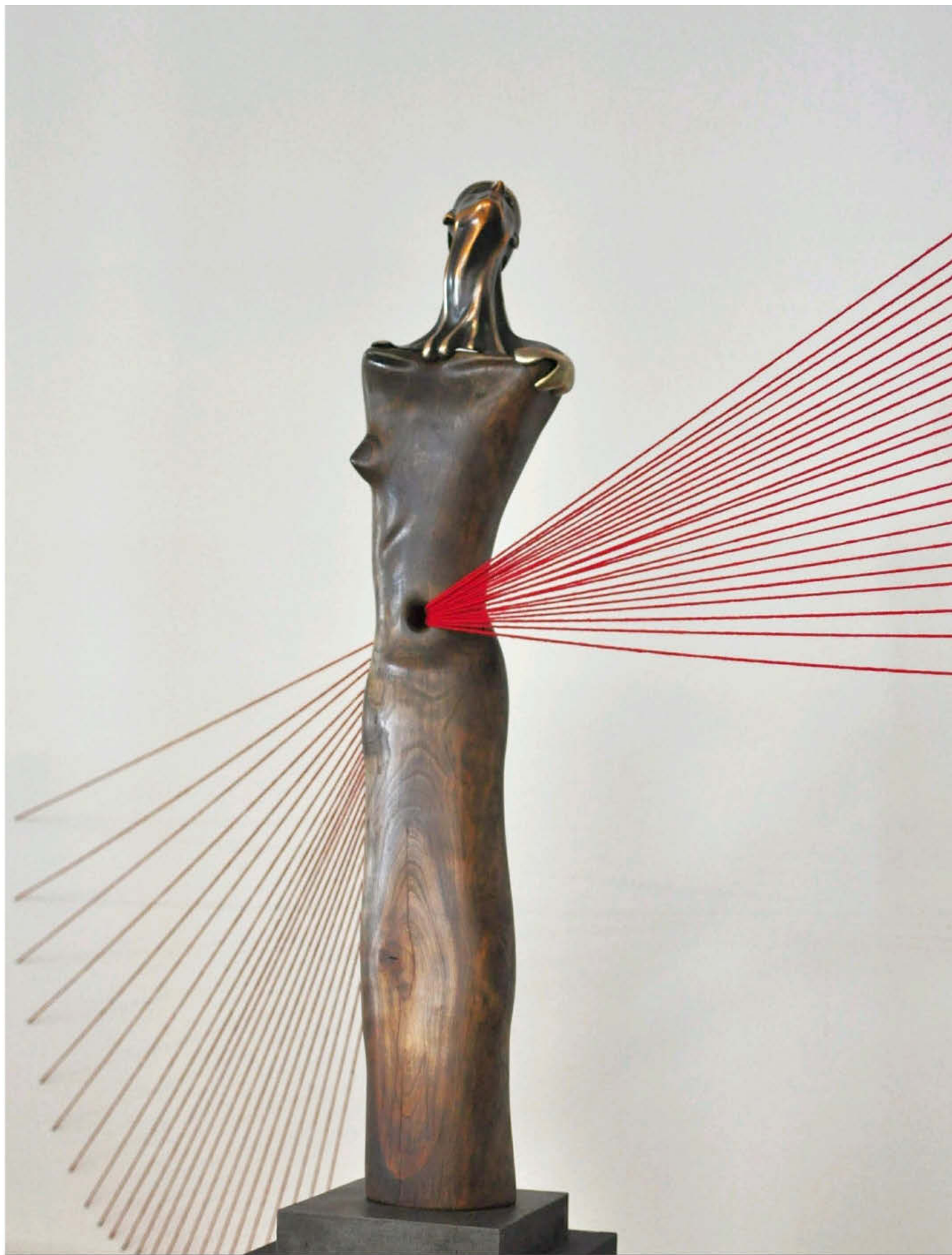
Fashionable Wound Bronze on wood, 40x40x162cm 2010, on edition (no AP)