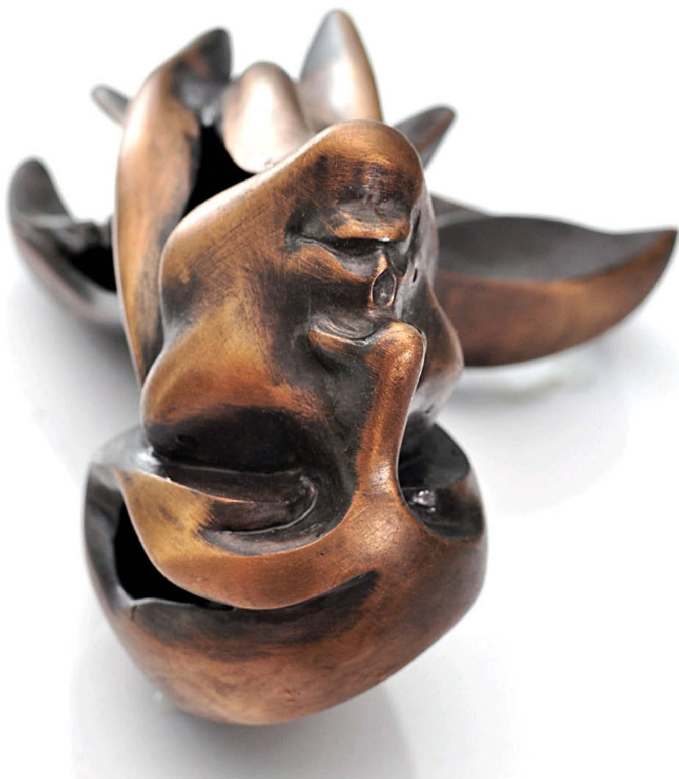
Prelude to a Kiss 30x21x21 cm Bronze casting 2021