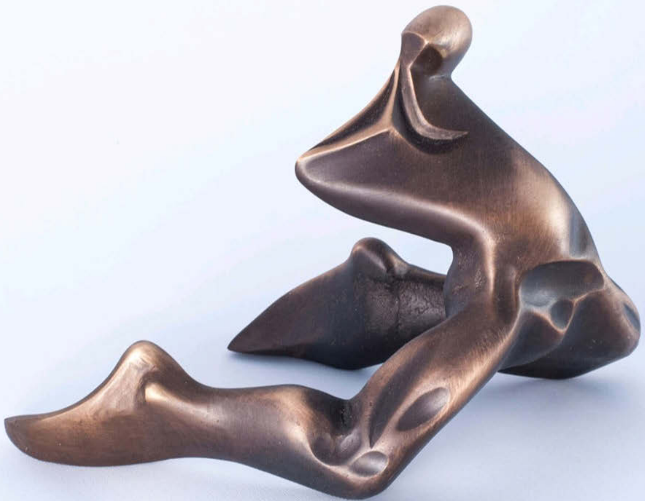
I'm Esfandiar 25x14x16 cm Bronze casting 2025, Edition 3/10