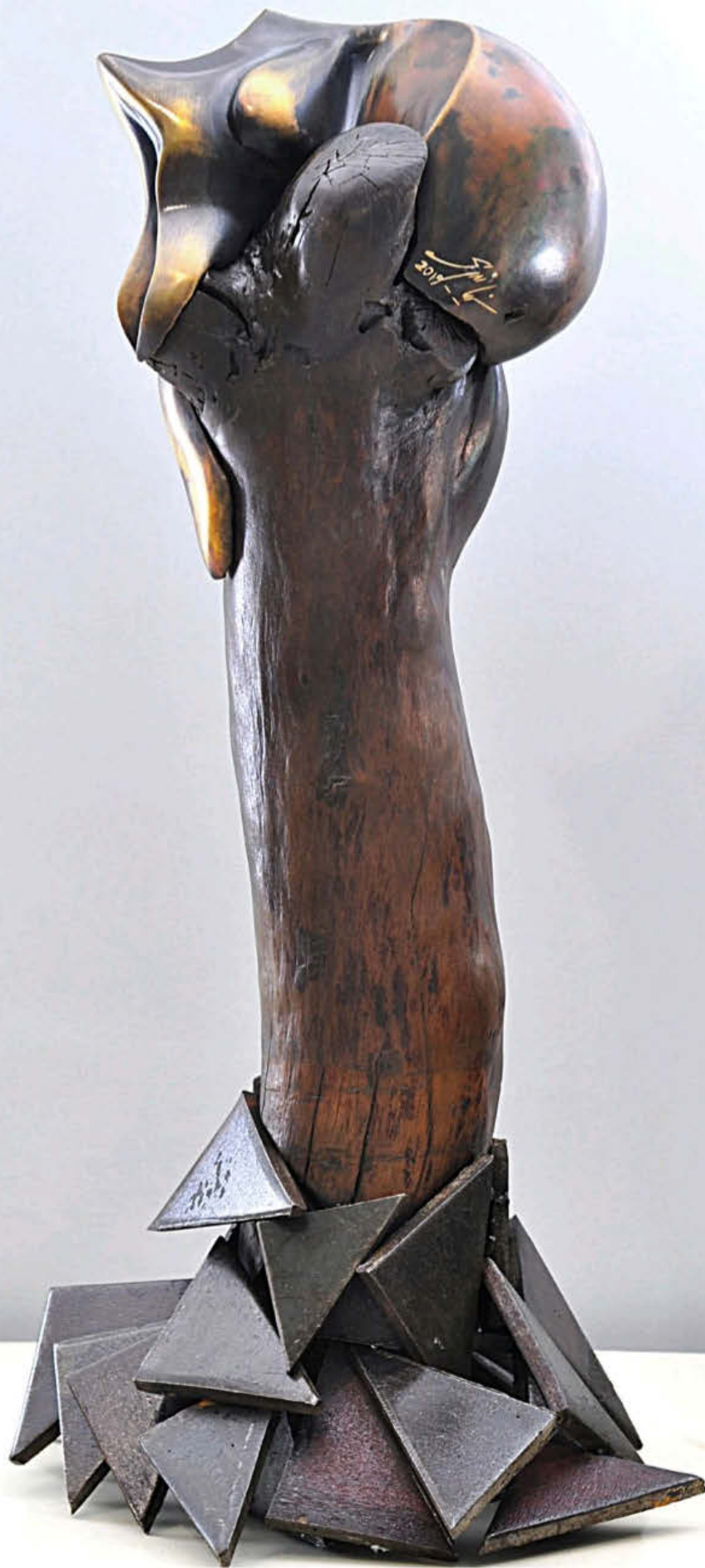
Holygrail Bronze, peachwood, iron, 77x33x43cm 2019