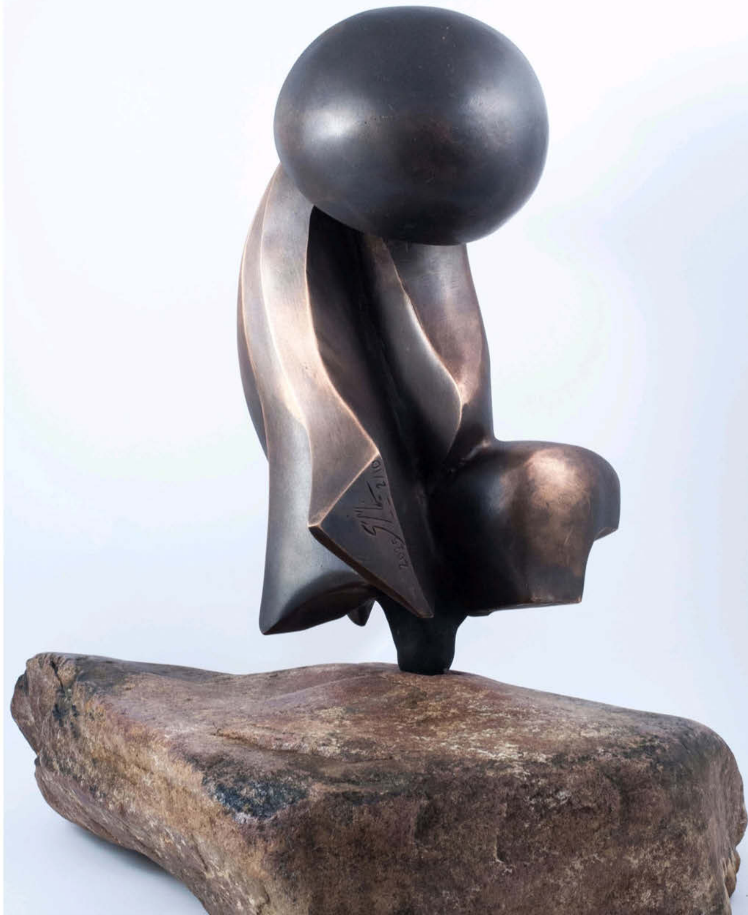
The more I see you Bronze 45x40x50cm, edition 2/10 2025,