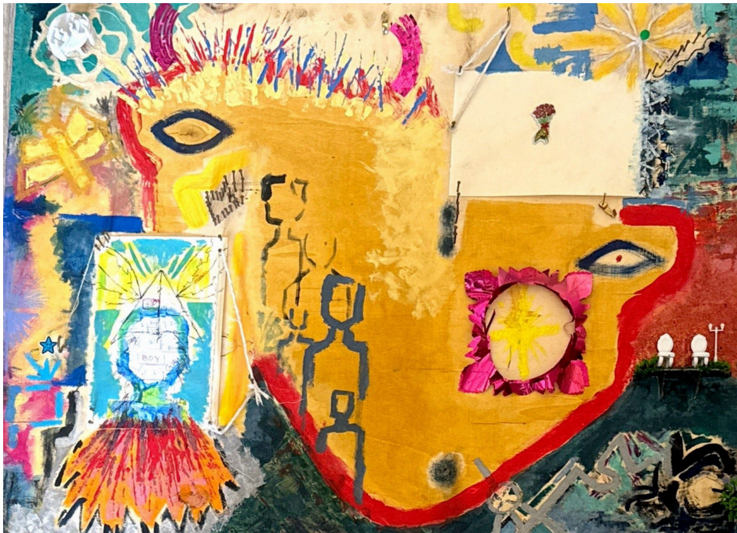
طلبات صعبة كثير - TALABAT SA3BA KETIR