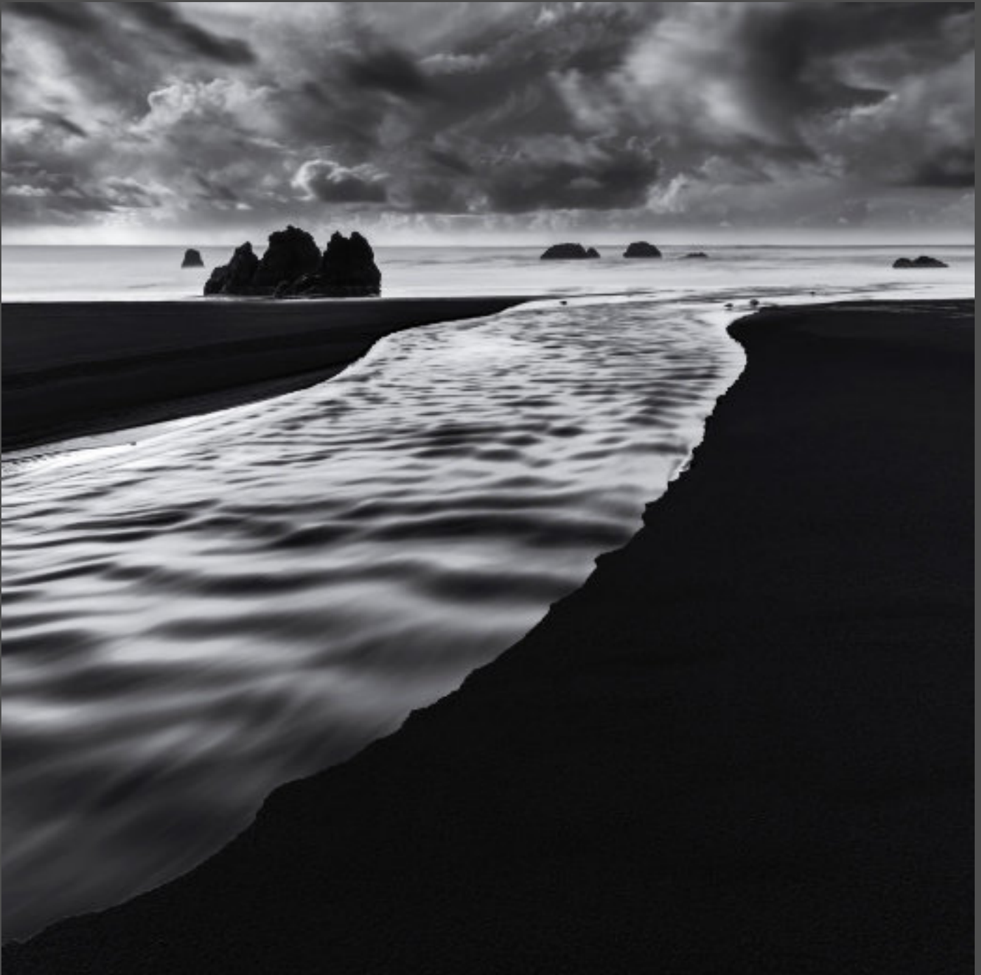
Pacifica no 1 18" x 18" - Giclee Print Pacifica series, 2019