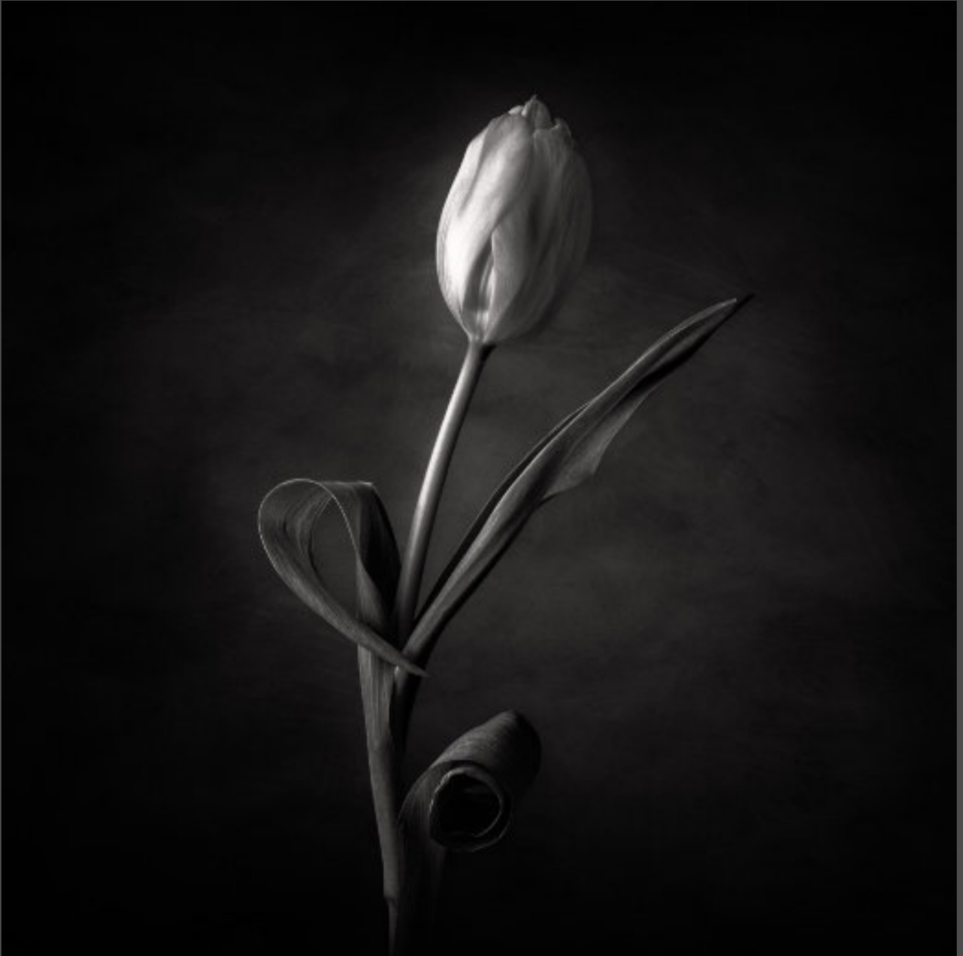
Dancing Tulips no.1 18" x 18" - Giclee Print Dancing Tulips series, 2022