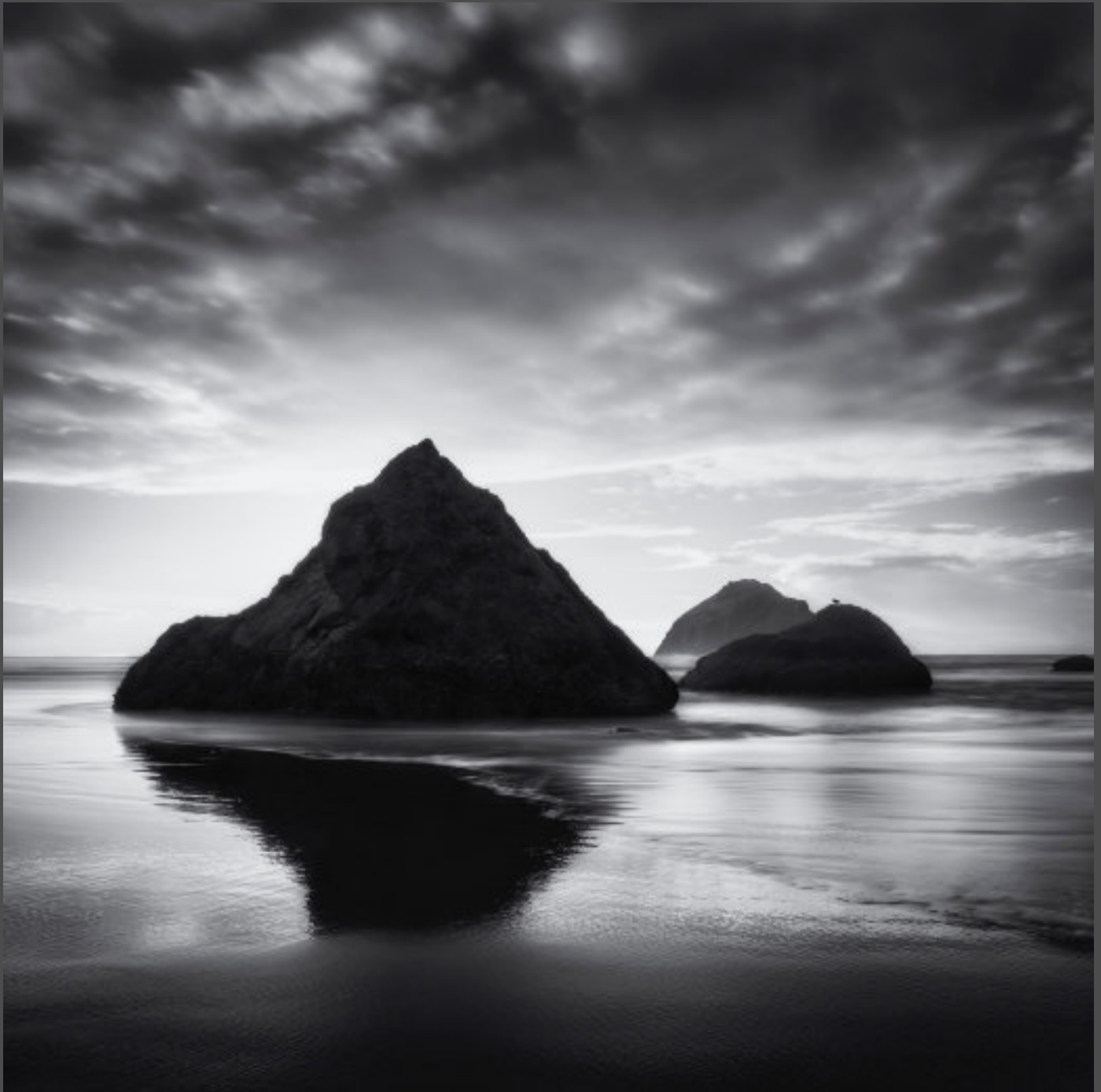
Pacifica no 2 18" x 18" - Giclee Print Pacifica series, 2019