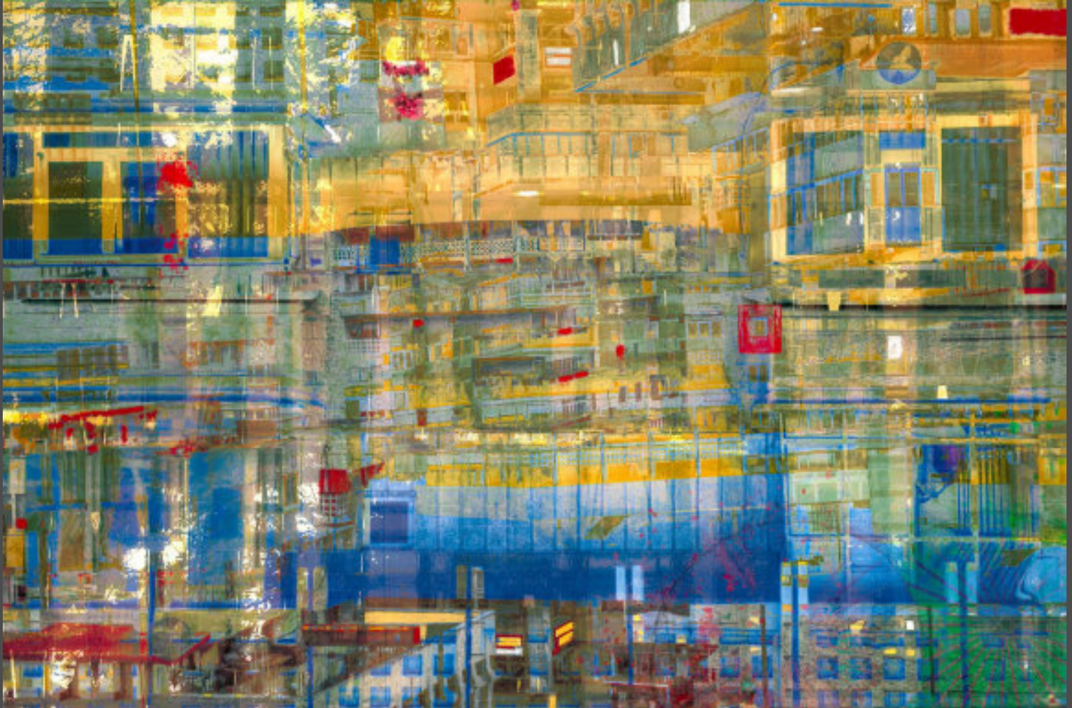
Urban Mosaic 27" x 18" - Giclee Print Urban Visions series, 2023