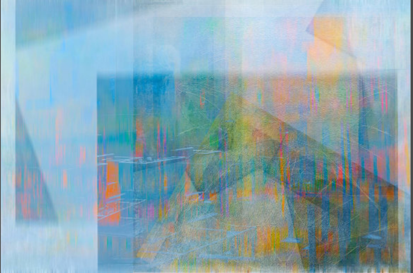
Abstract City 27" x 18" - Giclee Print Urban Visions series, 2023