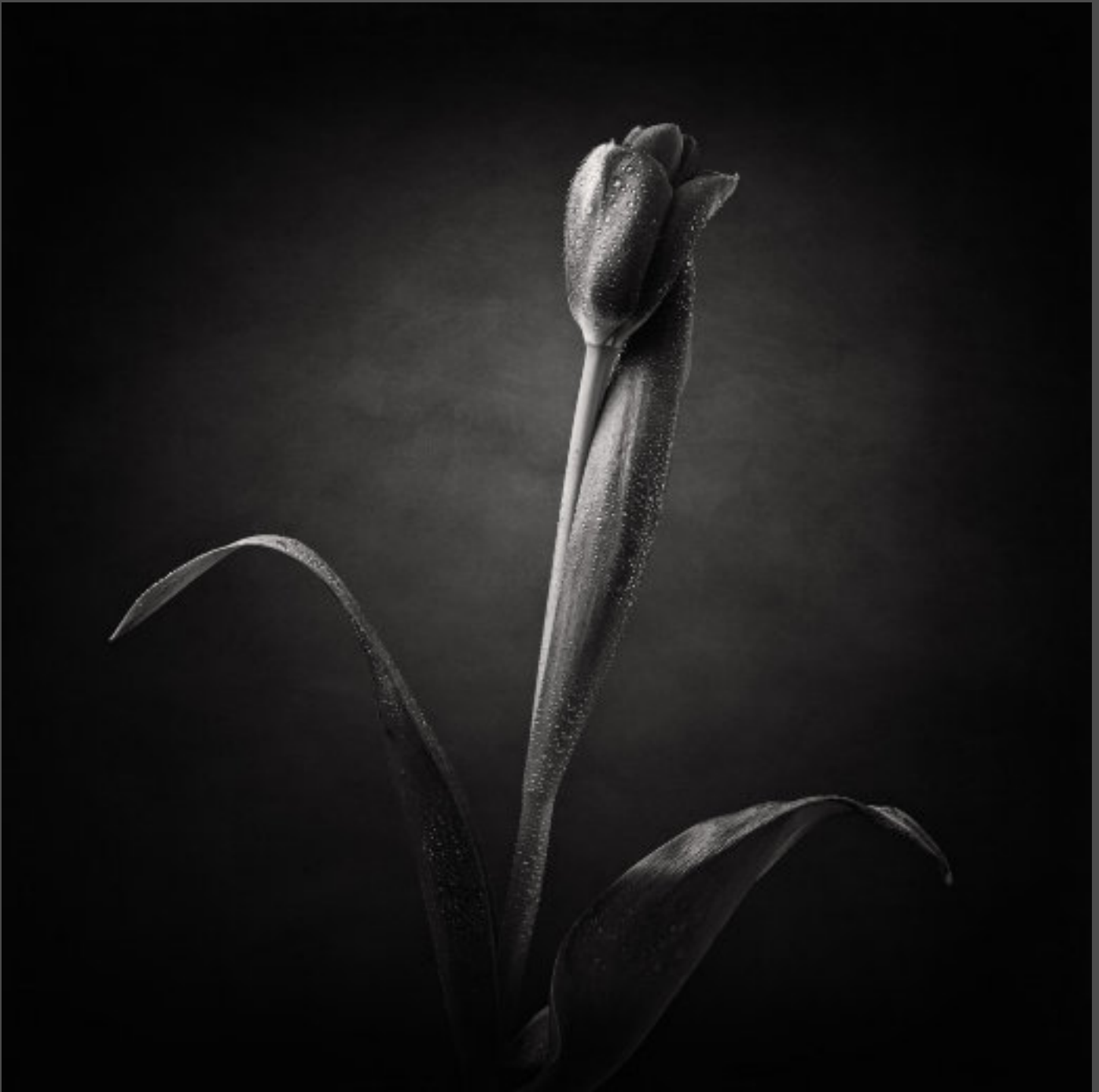
Dancing Tulips no.8 18" x 18" - Giclee Print Dancing Tulips series, 2022