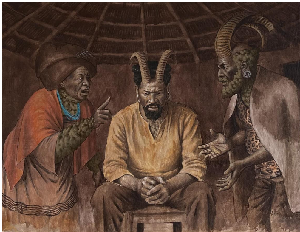
Ande Magoso Uphi Umalokazana? Acrylic on canvas 130cm X 170cm 2025 R 51 500