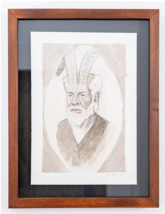
Ande Magoso uSgewu Mixed media on canvas 38cm X 29cm 2025 R 4 500