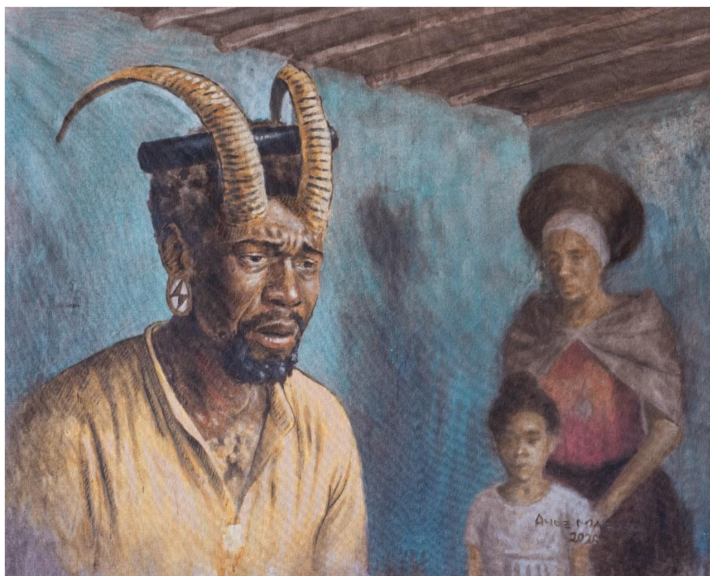
Ande Magoso Inqina Ka Mabuyaze Acrylic on canvas 105cm X 130cm 2025 R 39 000