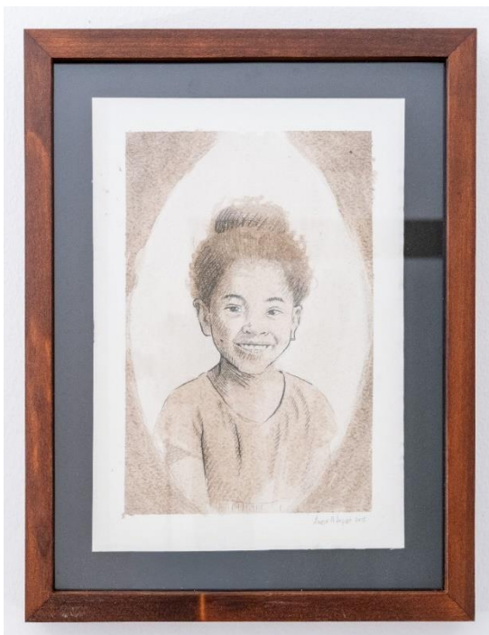
Ande Magoso uThingo Mixed media on canvas 38cm X 29cm 2025 R 4 500