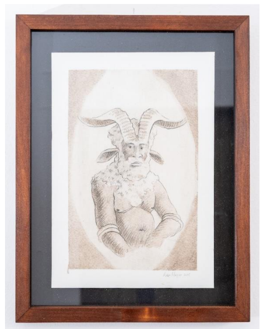
Ande Magoso uNgwadu Mixed media on canvas 38cm X 29cm 2025 R 4 500