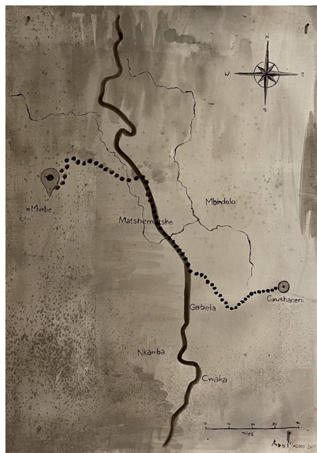
Ande Magoso Indlela KaMbulumakheqe Acrylic on paper 100cm X 70cm 2025 R 8 500 A1 size limited edition print: R 550