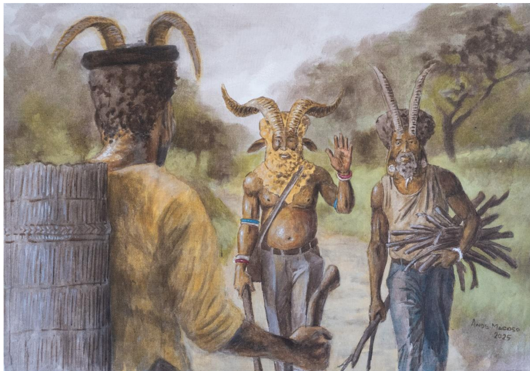
Ande Magoso Liyozilahla eMbindolo Acrylic on canvas 105cm X 150cm 2025 R 42 000