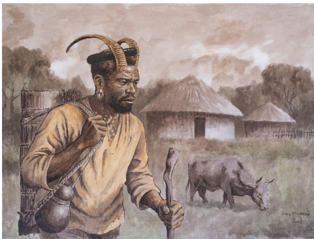
Ande Magoso Ngishela Le eMumbe Acrylic on canvas 114cm X 150cm 2025 R 44 500