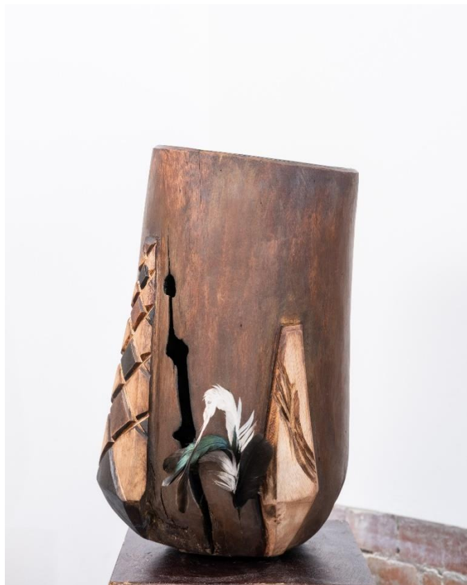
Ntobeko Chiliza Ithunga Wooden sculpture 27cm X 24cm X 48cm 2025 R 6 450