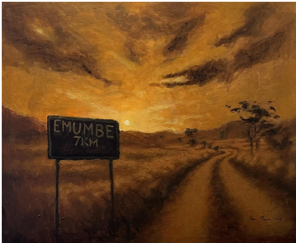
Ande Magoso Indlela Ebheke eMumbe Acrylic on canvas 76cm X 83cm 2025 R 24 500 A1 size limited edition print: R 950