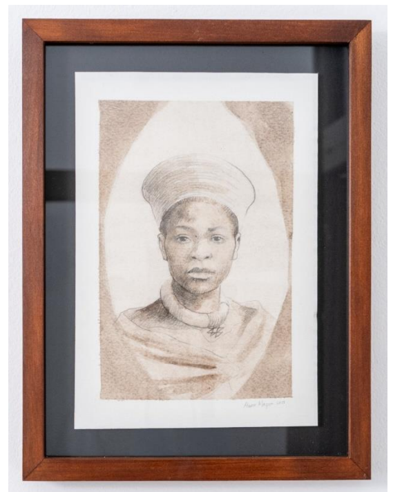
Ande Magoso uLang'elihle Mixed media on canvas 38cm X 29cm 2025 R 4 500