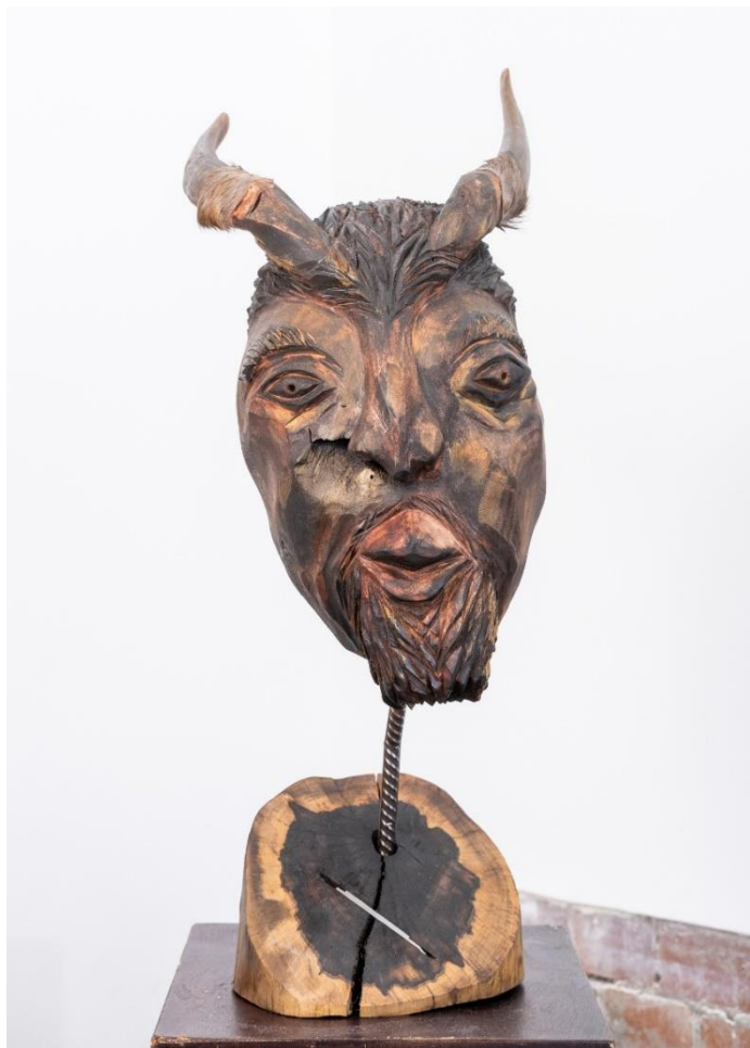
Ntobeko Chiliza UMBulumakheqe Wooden sculpture 20cm X 23cm X 68cm 2025 R 7 500