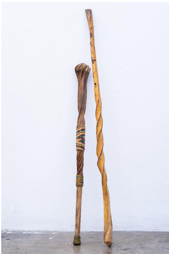
Ntobeko Chiliza Ubhoko Wooden sculpture 6cm X 64cm X 6cm 2025 R 350