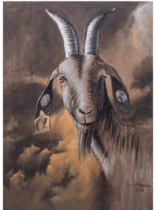
Ande Magoso Alpha Mixed media on canvas 112cm X 83cm 2025 R 29 000 A1 size limited edition print: R 1 100