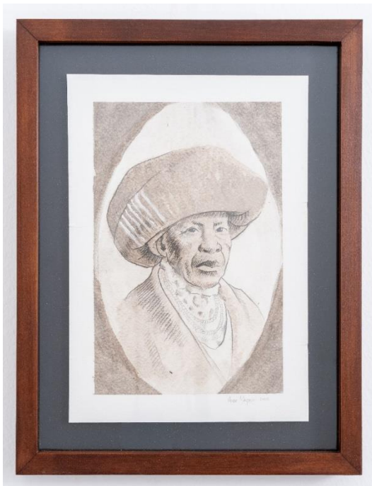
Ande Magoso uMaMxenge Mixed media on canvas 38cm X 29cm 2025 R 4 500