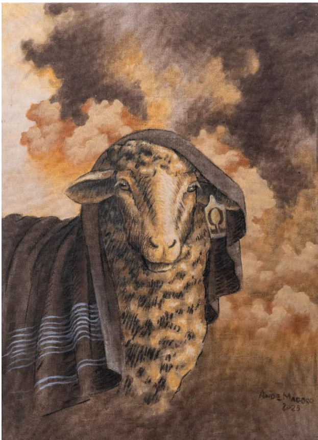
Ande Magoso Omega Mixed media on canvas 112cm X 83cm 2025 R 29 000 A1 size limited edition print: R 1 100