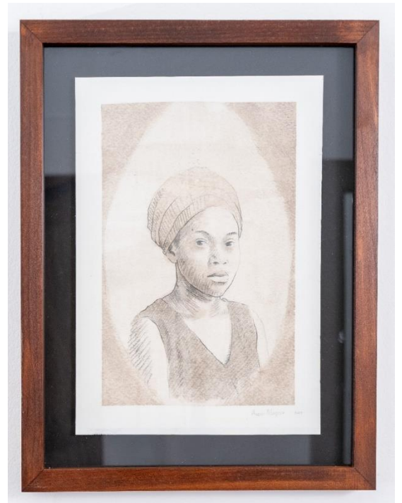
Ande Magoso uZimisa Mixed media on canvas 38cm X 29cm 2025 R 4 500