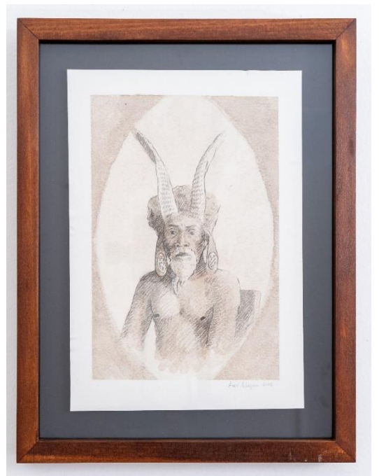
Ande Magoso uGela Mixed media on canvas 38cm X 29cm 2025 R 4 500