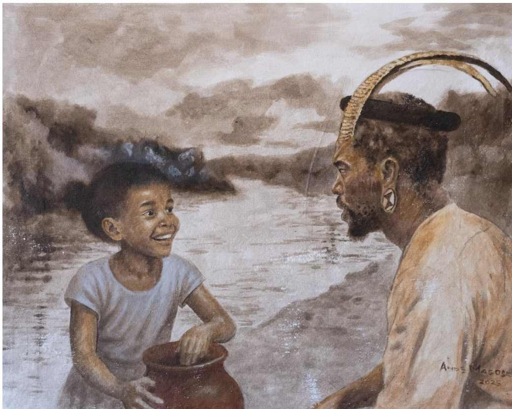
Ande Magoso UThingo WaseMbumbhe Acrylic on canvas 110cm X 130cm 2025 R 39 500