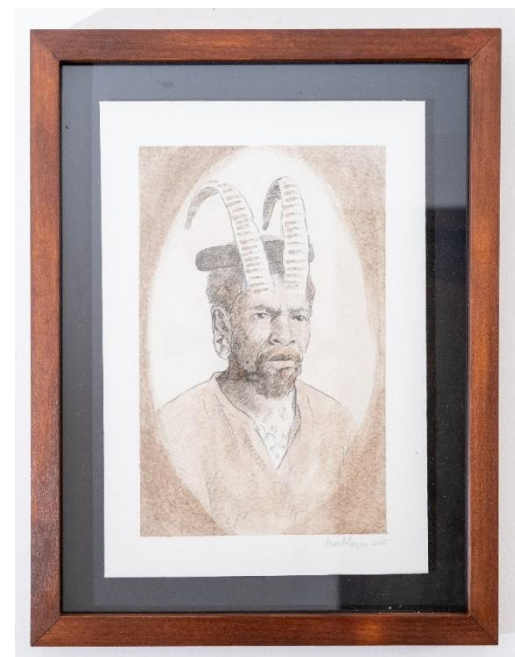
Ande Magoso uMbulumakheqe Mixed media on canvas 38cm X 29cm 2025 R 4 500