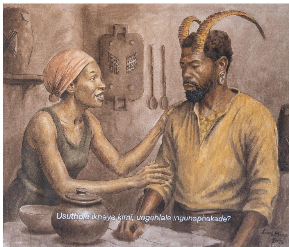
Ande Magoso Ungehlale Ingunaphakade? Acrylic on canvas 110cm X 130cm 2025 R 47 500